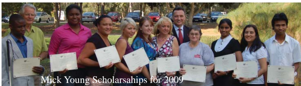
Mick Young Scholarships for 2009