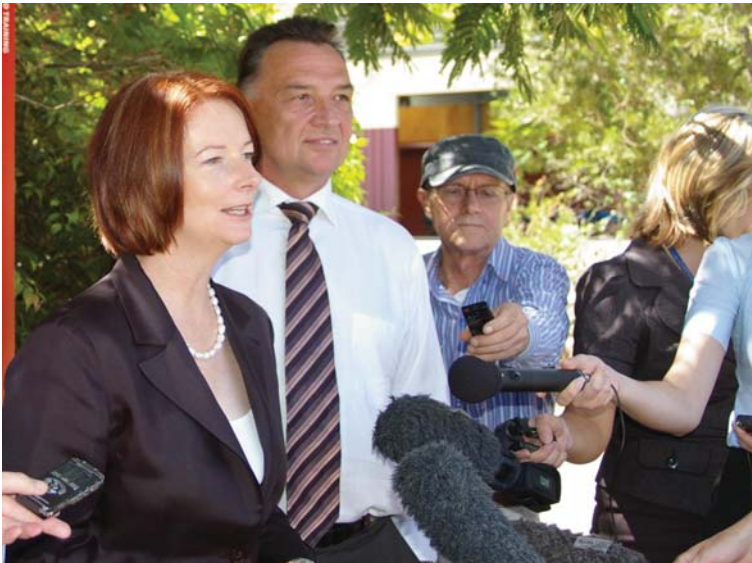
Picture: Craig Emerson and Deputy Prime Minister Julia Gillard make the announcement of funding at a local school.