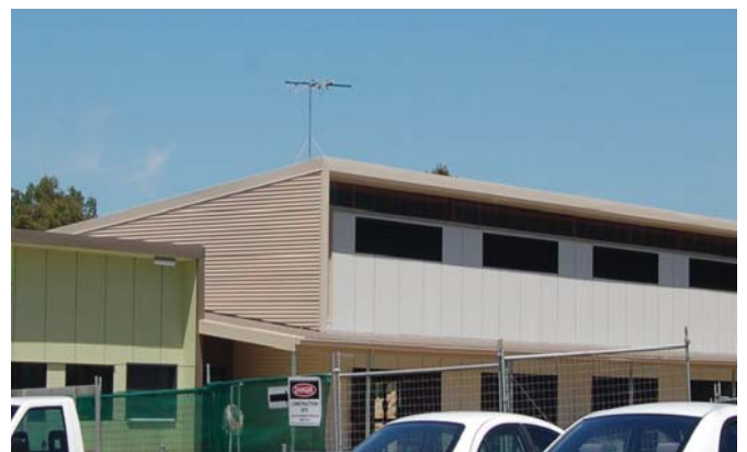
Picture: The new resource centre and multipurpose hall at Berrinba East.

As your local Member of Parliament I will continue to make sure schools in Logan City get their fair share of the Rudd Government's nation-building infrastructure projects.