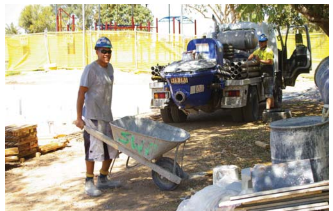
Picture: Funding has assisted in local job creation while providing new facilities that are much-needed by Harris Fields students.

As your local Member of Parliament I will continue to make sure schools in Logan City get their fair share of the Rudd Government's nation-building economic stimulus funding.