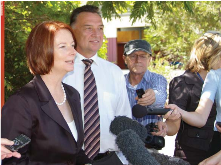
Picture: Craig Emerson (centre) and Deputy Prime Minister Julia Gillard make announcement of the funding at a local school.

A good education means a good start to life — that's why the Rudd Government is committed to making sure our children have access to the best opportunities.